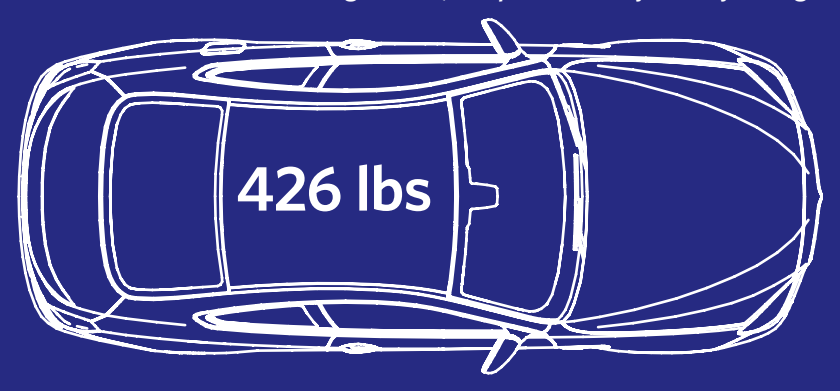
Plastics and polymers are used in hundreds of individual parts in an EV.

In fact, according to America's Plastic Makers, in 2023 the average EV uses 426 lbs of plastic and polymer components. And according to the EPA, the average horsepower of model 2023 vehicles has reached a record high of 272, compared to 203 just ten years ago.