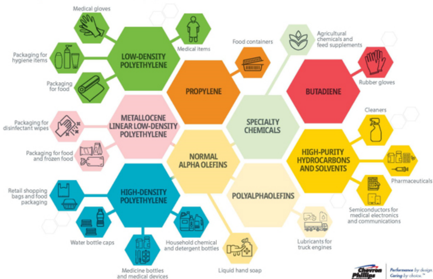
Chemicals are integral to a range of critical products from medical cleaning solvents to packaging that keeps food protected.

The products that we manufacture are critical building blocks for many items that are integral to our daily lives, especially during a global health crisis. From healthcare to cleaning and disinfecting, transportation and many more uses, our products will help us persevere. There has never been a better time for us to demonstrate our commitment to Performance by design, Caring by choice.™ Some of our products and uses in critical everyday items include: