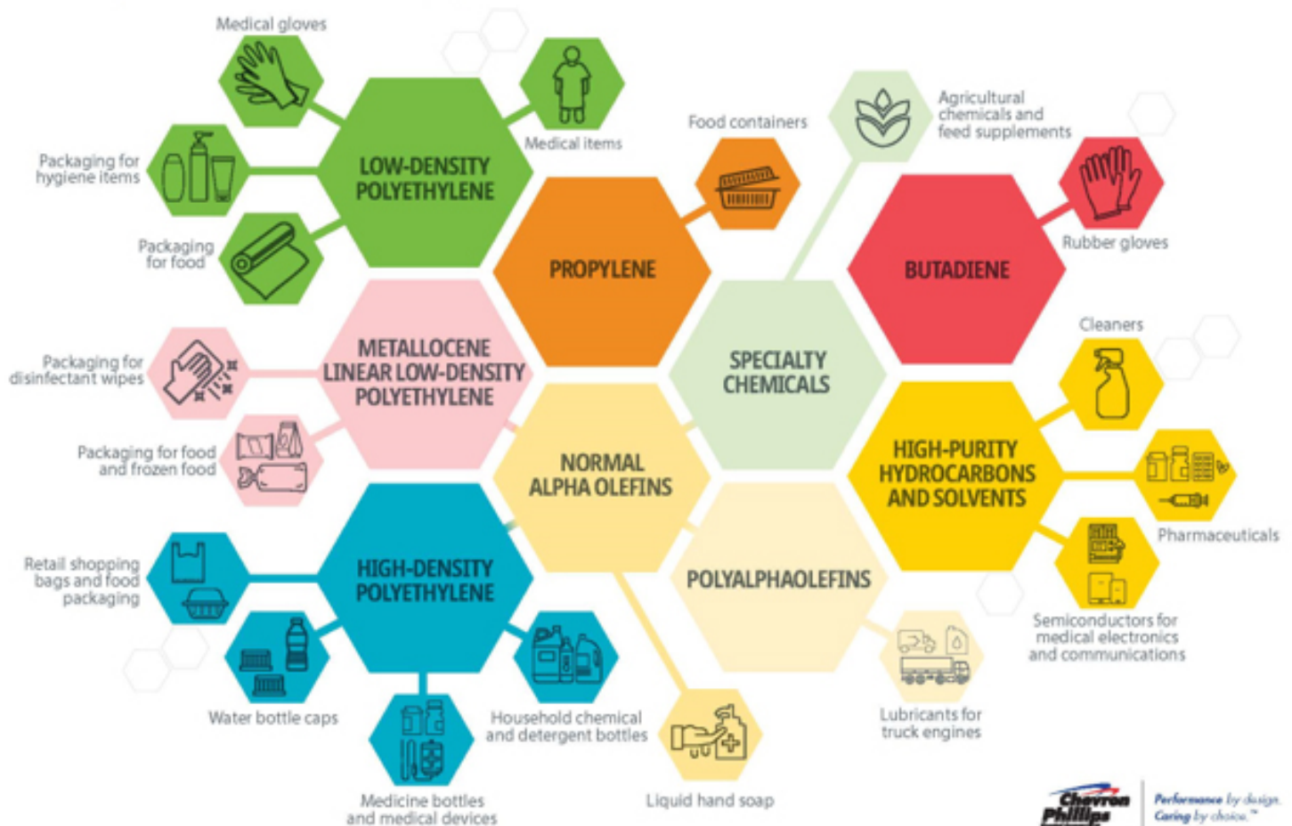
Chemicals are integral to a range of critical products from medical cleaning solvents to packaging that keeps food protected.

The products that we manufacture are critical building blocks for many items that are integral to our daily lives, especially during a global health crisis. From healthcare to cleaning and disinfecting, transportation and many more uses, our products will help us persevere. There has never been a better time for us to demonstrate our commitment to Performance by design, Caring by choice.™ Some of our products and uses in critical everyday items include: