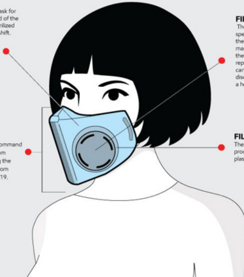
Reusable PPE can be sterilized and worn multiple times to alleviate supply shortages and protect frontline health care workers.

The filter housing can be mass produced using medical-grade plastics through injection molding.